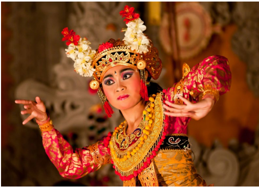
BALI (BENOA), INDONESIA