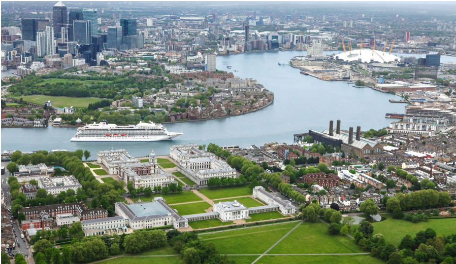
GREENWICH (LONDON), ENGLAND