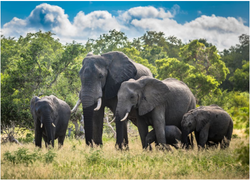
GQEBERHA (PORT ELIZABETH), SOUTH AFRICA