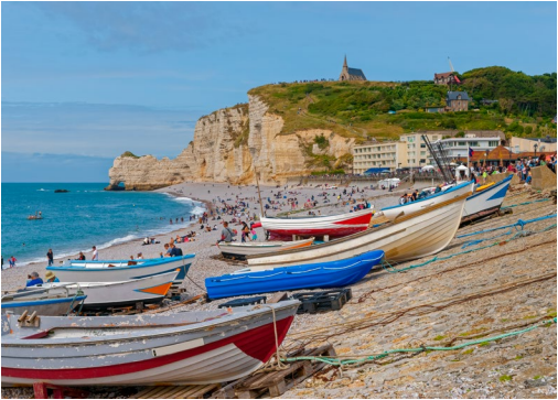
PARIS (LE HAVRE), FRANCE

Itinerary is subject to change at any time without notice.