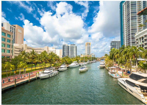
FORT LAUDERDALE, FLORIDA

Set sail on an epic journey of discovery as you traverse the globe. Explore the world’s majestic cities and immerse yourself in local cultures during overnight stays in 16 ports. Discover the faraway lands of the South Pacific and the colonial treasures of Asia. Traverse the Indian Ocean and sail to Africa in search of the “Big 5.” Visit intriguing Morocco and call at charming cities on the Iberian Peninsula before exploring London’s royal history.