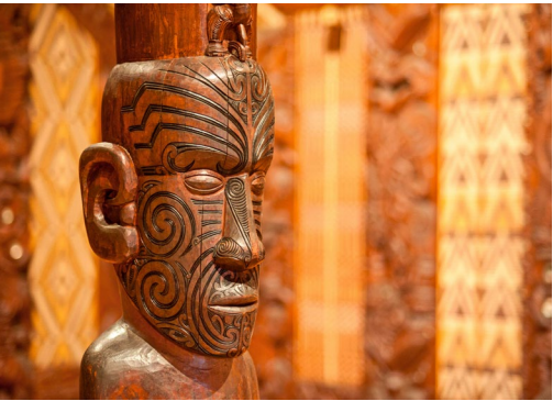
BAY OF ISLANDS (WAITANGI), NEW ZEALAND