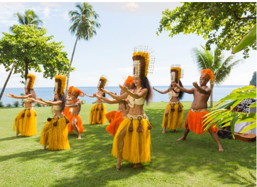
TAHITI (PAPEETE), FRENCH POLYNESIA