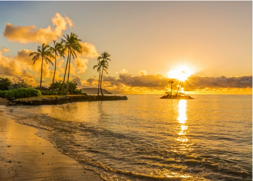
OAHU (HONOLULU), HAWAII

Itinerary is subject to change at any time without notice.