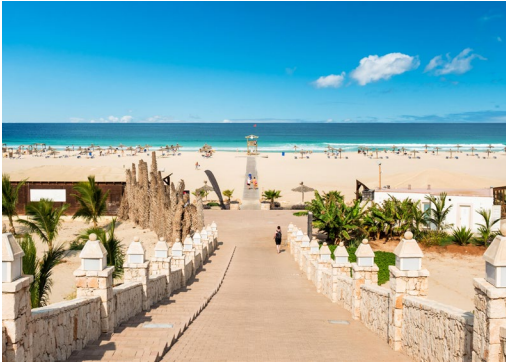
PRAIA, CAPE VERDE