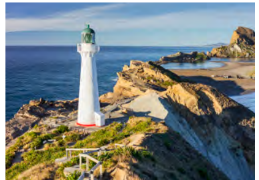
WELLINGTON, NEW ZEALAND