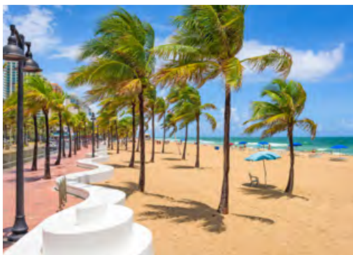
FORT LAUDERDALE, FLORIDA

Set sail on an epic journey of discovery as you traverse the globe. Explore the world's majestic cities and immerse yourself in local cultures during overnight stays in 11 ports. Discover the idyllic isles and the faraway lands of the South Pacific and the colonial treasures of Asia. From the Arabian Peninsula to the Red Sea, witness several millennia of history, and revel in the romance of Paris and the royal history of London, England's iconic capital.