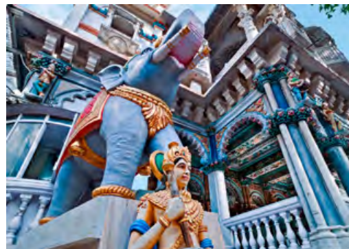
MUMBAI (BOMBAY), INDIA