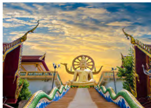
KOH SAMUI, THAILAND