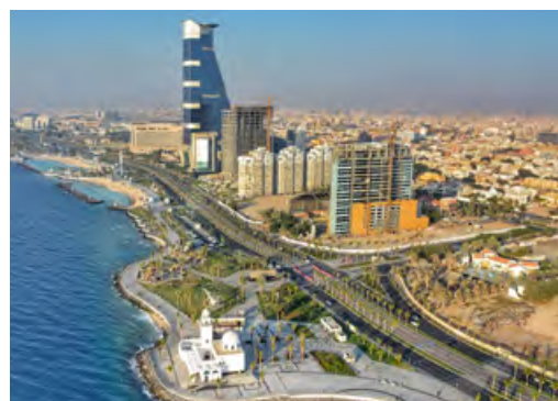
JEDDAH, SAUDI ARABIA

Itinerary is subject to change at any time without notice.