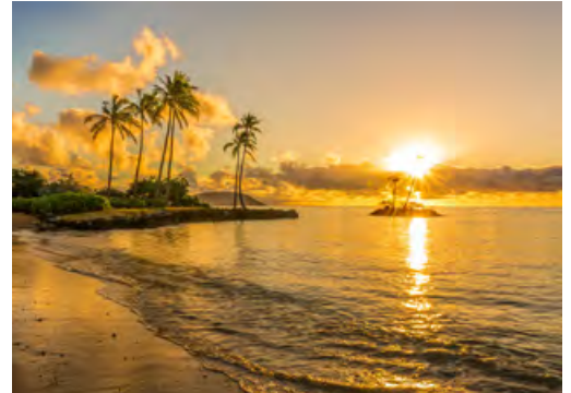
HONOLULU, OAHU, HI

Itinerary is subject to change at any time without notice.